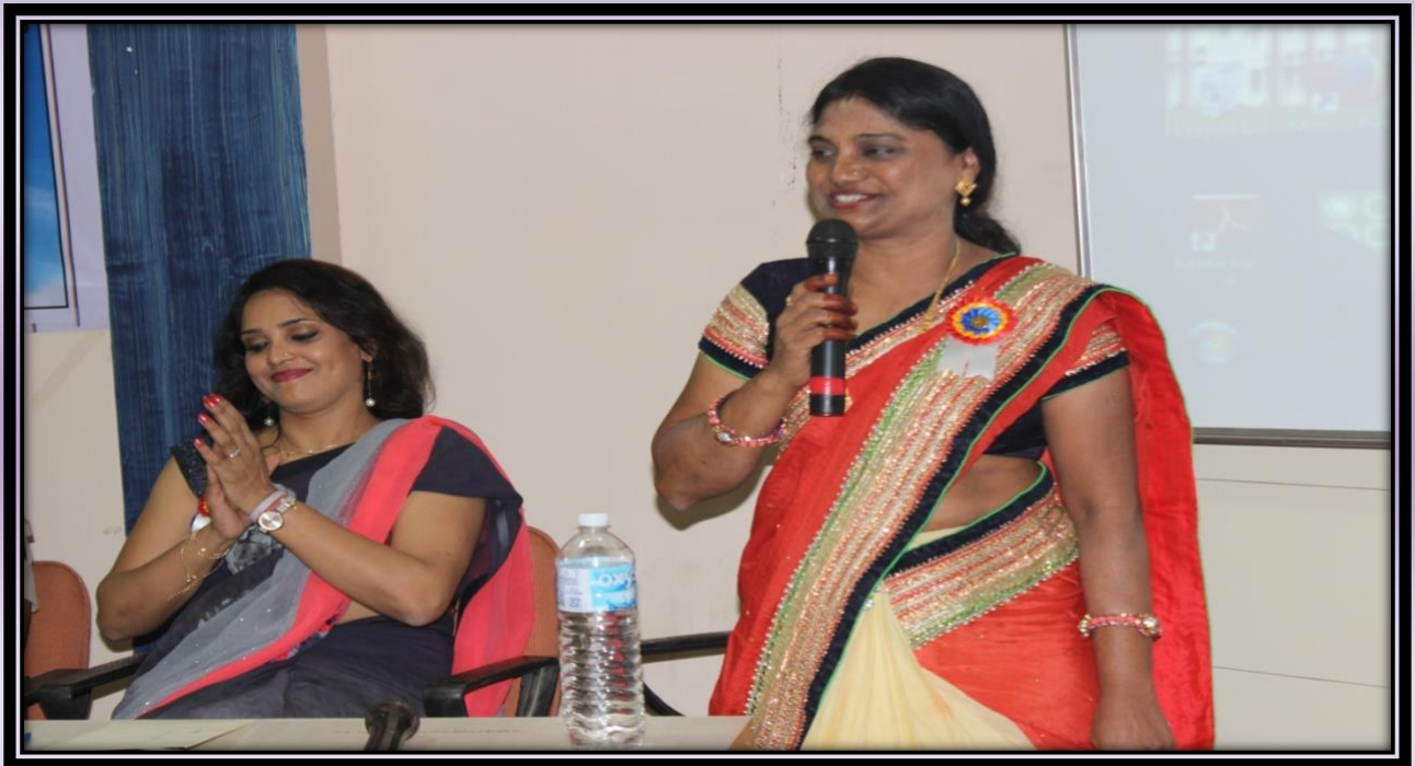
Women's Day Celebration on 8/03/2019